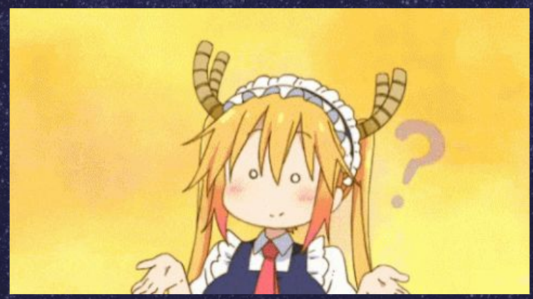
Delays are fun. You never know when to expect them, but it's been the theme of our month.