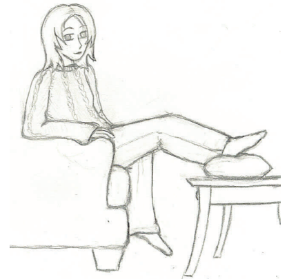
I stubbed my toe and damaged my tendon in my right foot. Here I am working on the newsletter, with my foot up.

Of course, I must have an ulterior motive as I am the evil mantis, so this newsletter will also be a small outlet for some of my personal creativity. I'd like people to be able to put a face and personality with the title of Chair, and hopefully to