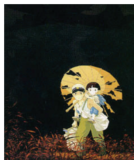
An image of Seita and his sister, Setsuko.

I would like to start with a great anime, Grave of the Fireflies.