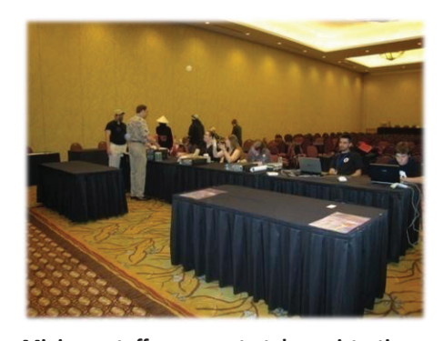
Mini-con staff prepares to take registrations