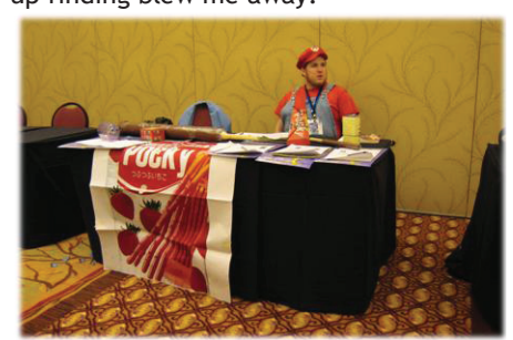
Pocky Club table at Mini-con

Many surprises greeted me today when I arrived at Uwajimaya in Beaverton. I had the day off and a fresh paycheck in the bank ready for frivolous spending. The plan was to get some fresh Pocky for my Memorial Day festivities. What I ended up finding blew me away.