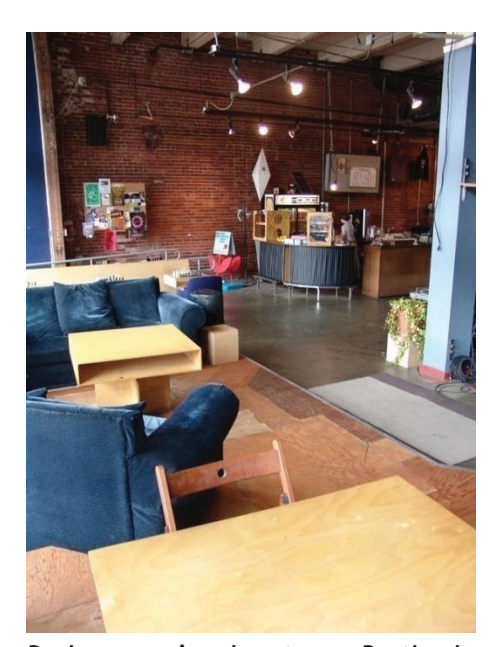
Backspace, in downtown Portland featuring LAN gaming, video games, and a café. Open late every night.